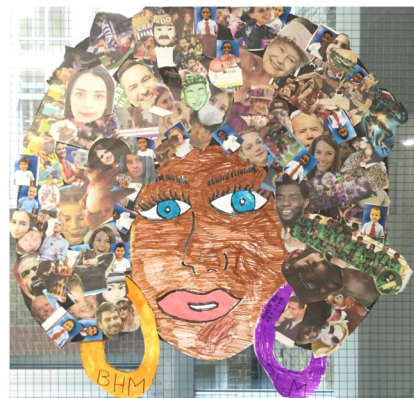
KS1 Art Club Collage