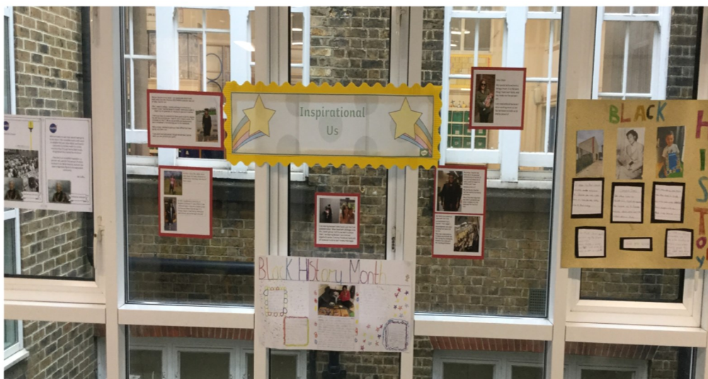
'Our Inspirations' Display