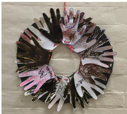
'What Makes Us Unique' handprints wreaths

As you are aware from previous correspondence, we have been following the theme of, 'Our Inspirations,' during Black History Month, thinking about who and what inspires us. Take a look at some of the things we have been doing so far in school to celebrate this!